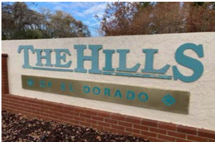
Original Entrance Sign in 2021

Residents have expressed hope that long deferred maintenance will continue, including trimming of oak trees that hang five feet above the sidewalks along Tea Rose Drive, along with landscape freshening, and maintenance of the entrance split rail fence.