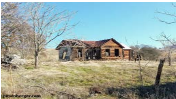
Joerger House

Ultimately, he bought out his partner a year later and his descendants farmed the property for the next hundred plus years. The Euer Ranch was removed