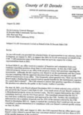
(Auditor's Letter to EDH CSD)

receive them by the August 10th deadline. I called you, texted you, and emailed you regarding this matter on August 17th. I also texted your Board President and talked to another Director on the phone on August 17. In response, not only did you refuse to provide the same representations and warranties that were provided in 2021, but you acknowledged the existence of inaccuracies in the assessments. Whether or not those inaccuracies are the result of information provided by the County is irrelevant as it is the CSD that bears responsibility for confirming the accuracy of its assessments prior to placement on the tax roll.