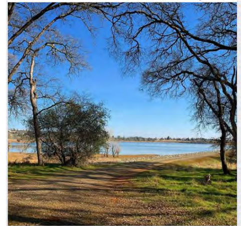
El Dorado Hills Community Services District Yesterday at 3:47 PM