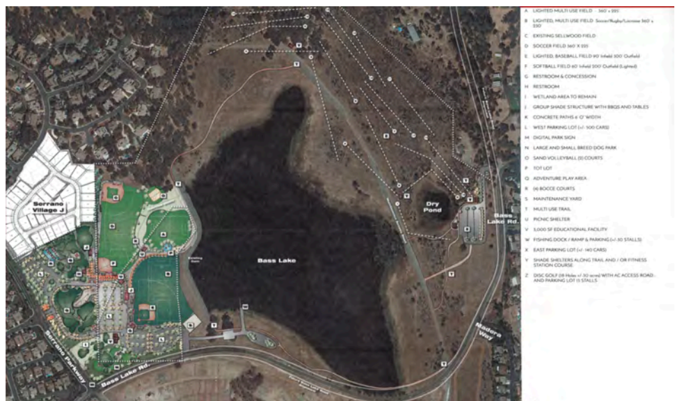
Conceptual Bass Lake Park, with Village J Lot H 12.5 acre parkland on the west