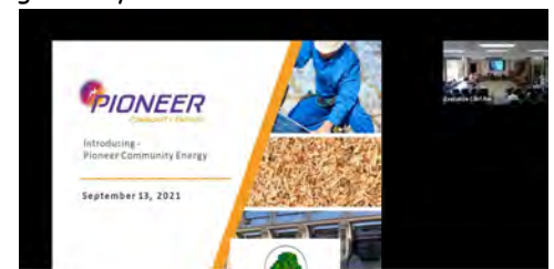
El Dorado Hills Community Council September meeting recording

According to their web site, they are governed by a board of locally elected officials and have an established goal of providing electricity at more stable and competitive rates. Their board meetings are open to the public and the public may comment on the board's agenda items as well as on items not on the agenda generally.