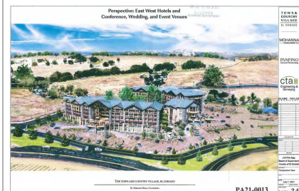
Elevation rendering of proposed 2-Hotel Project