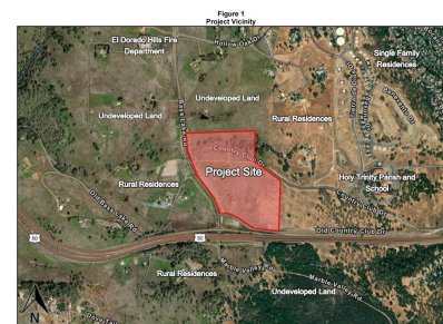
Project site at Bass Lake Rd & Country Club Drive

https://edhapac.org/documents/town-and-country-village-el-dorado-pa21-0013/