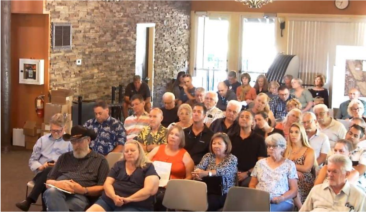
A large turnout of residents at the July 13, 2023 EDH CSD Board of Directors Meeting - image credit: EDH CSD