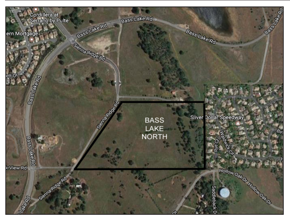
Map showing the approximate location of the planned development

The Voice of the Bass Lake Community www.basslakeaction.org