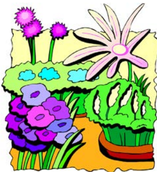
Plant a Garden

The portion of Silva Valley Road that goes under Highway 50 is getting a new name — Clarksville Crossing.