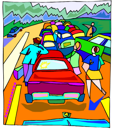
The future White Rock Road?

The thoroughfare portion of the Connector is described as similar to an urban arterial, with four to six traffic lanes. The left turns are limited to at-grade signalized intersection. These intersections are to be spaced a minimum of one half mile apart, with one mile spacing preferred and quarter-mile spacing allowed only in locations where consolidation of existing and approved intersections is not feasible. Direct access will also be minimized, with any driveways to be consolidated or eliminated where feasible.