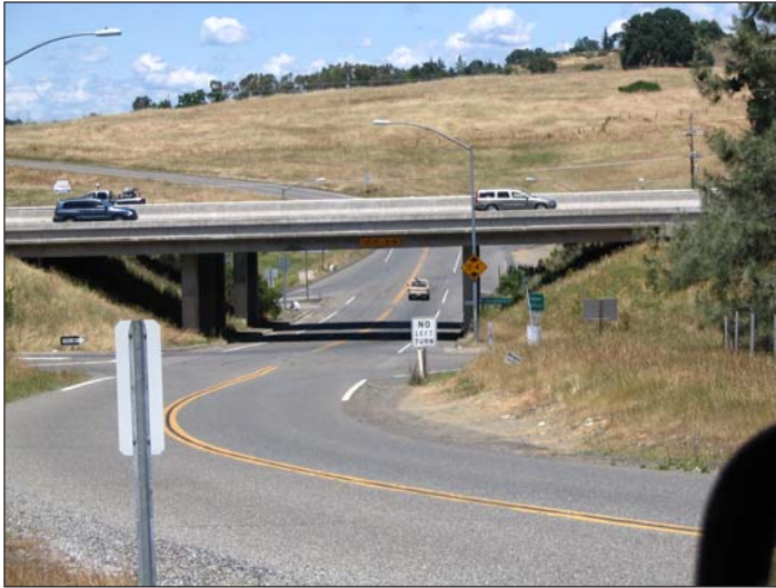
Bass Lake Road and Highway 50 interchange scheduled for signalization and improvement