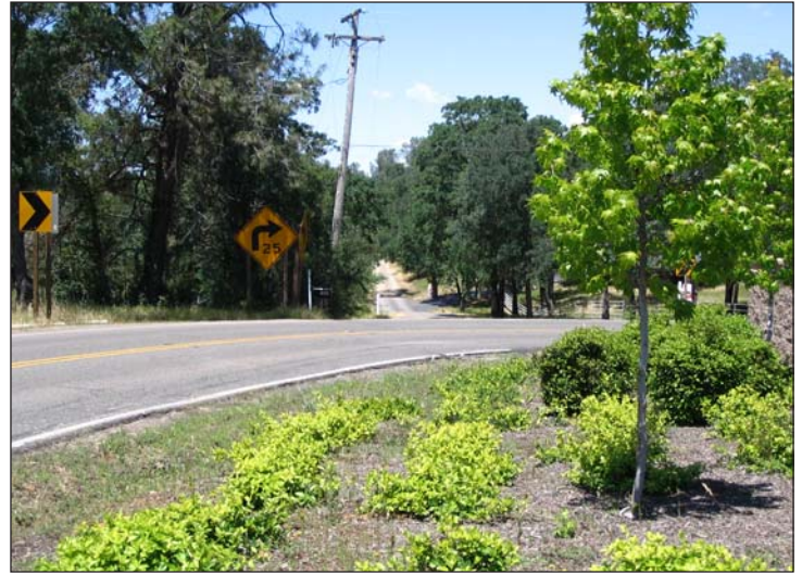
The point where Silver Springs Parkway will extend from Bass Lake Road north to Green Valley Road