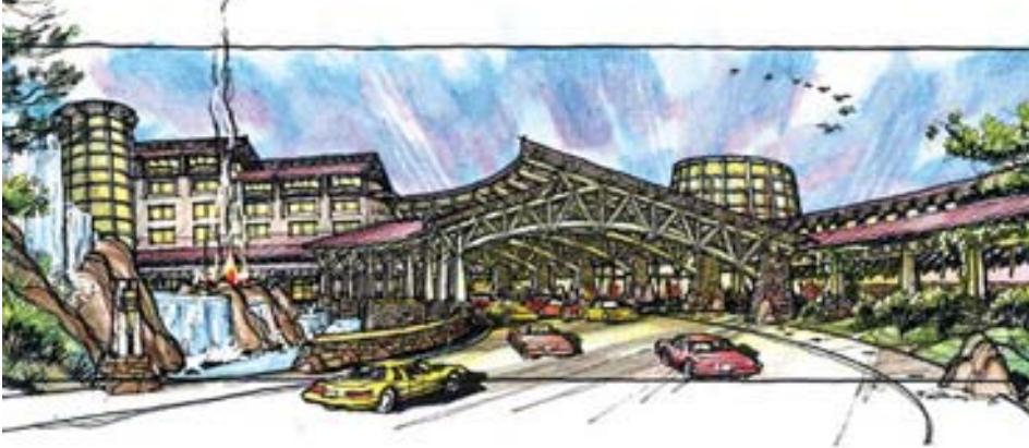
Artist's concept of planned casino and hotel